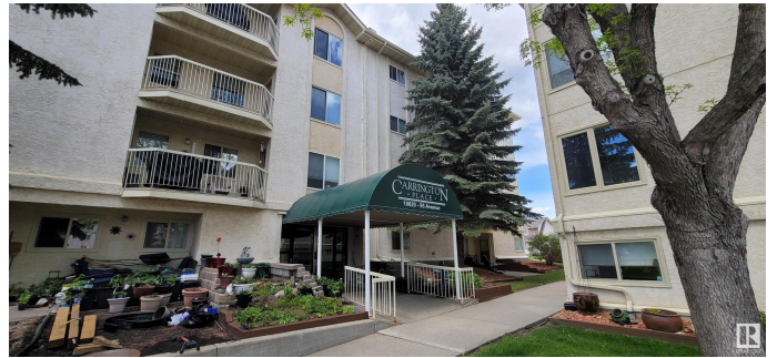
Carrington Place Building C

SUITE TYPE 2 D + DEN 1388 sq ft (1329 sq ft) FLOOR AREAS SHOWN MAY VARY FROM ACTUAL CONSTRUCTED UNITS.