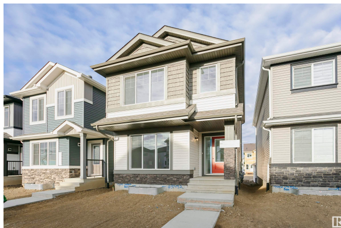
9564 Carson Bend SW, Edmonton, AB

Main Floor Exterior Area 74.83 m 2 Interior Area 68.68 m 2